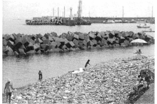
Fig.2 Sampling site of the present new species

Remarks : As far as I am aware, four species have been record as valid. The present new species is most closely allied to Quelpartoniscus tsushimaensis (Nunomura, 1990) known from Tsushima, but the former is separated from the latter in the following features: (1) paler color pattern, (2) less numerous ommatidia of eyes, (3) numerous teeth on the outer lobe of maxillula, (4) almost right-angled posterior part of pleotelson, (5) stouter endopod of male first pleopod, bearing denticles, (6) relatively shorter endopod of male second pleopod and (7) numerous aesthetascs on the last segment of antennule. The present new species is also allied to Q. setoensis Nunomura, 2003 reported from Shirahama, Wakayama, but differs from it in the following features: (1) darker body color, (2) projection of protuberances on the both sides of anterior of margin of cephalon, (3) less numerous ommatidia of eyes, (4) numerous teeth on the outer lobe of maxillula, (5) stouter penes with a cleft of posterior area and (6) numerous aesthetascs on the last segment of antennule.