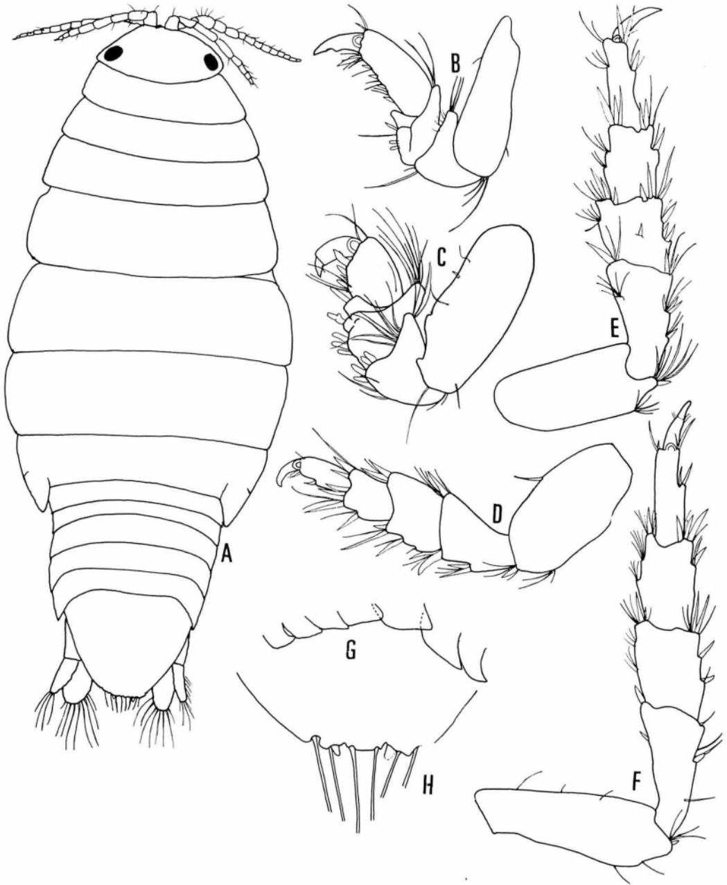
Fig. 1. Eurydice akiyamai sp. nov.,

A. Dorsal view; B. First peraeopod; C. Third peraeopod; D. Fourth peraeopod; E. Sixth peraeopod; F. Seventh peraeopod; G. Lateral view of epimera of peraeonal somites; H. Posterior part of pleotelson. (A-H: holotype).