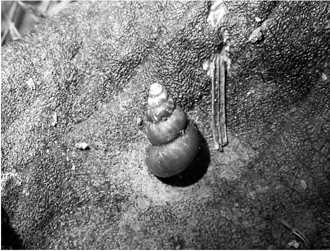
Fig. 3 Fukuia integra collected at Loc. 2.

the leaf litter layer. Empty N. micron shells were milky white in color due to weathering and more or less broken around the aperture.