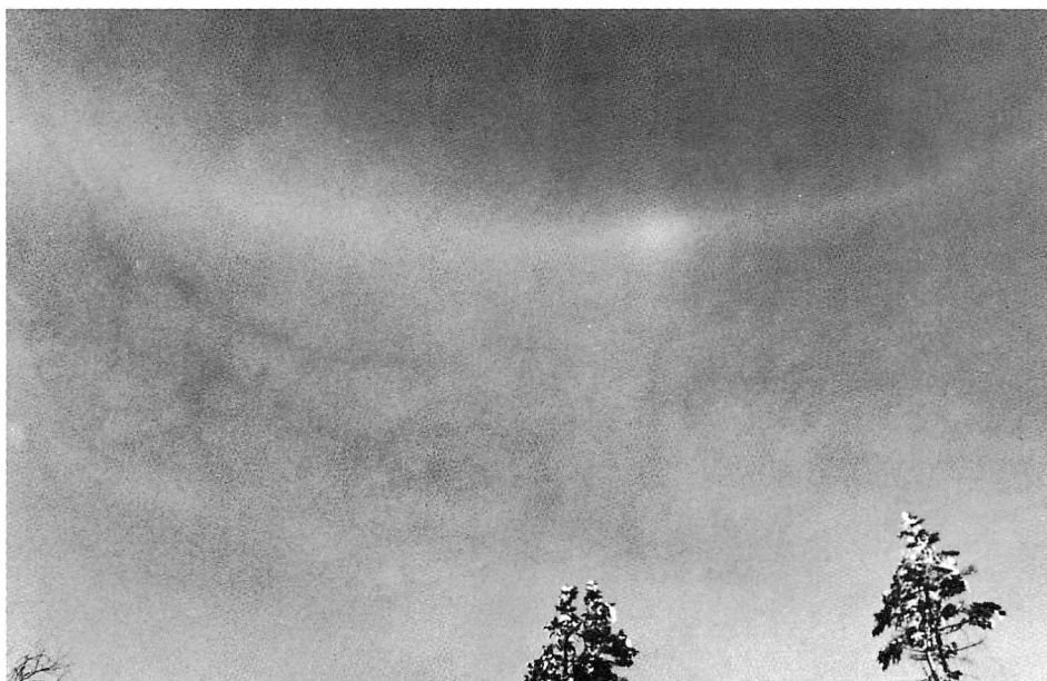
Fig. 1 120-degree parhelia on the parhelic circle.

Greenler, R., 1980, Rainbows, Halos, and Glories (Cambridge U. Press)