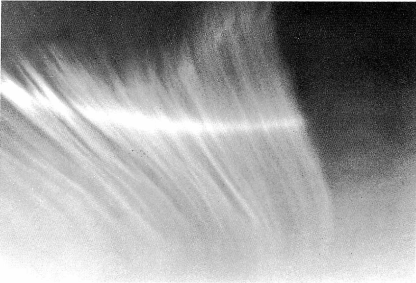
Fig. 2 The bright line, a partial figure of the parhelic circle, in cirrus clouds.